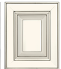
Vintage Linen Maple