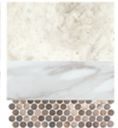
Countertops, Floor & Shower Tile Lav Backsplash & Shower Floor (with Auburn & Almond Cabinets)