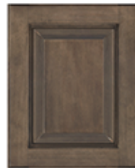
High-Gloss Stonewall Grey