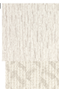
Wallboard Accent - Fountain Cashmere